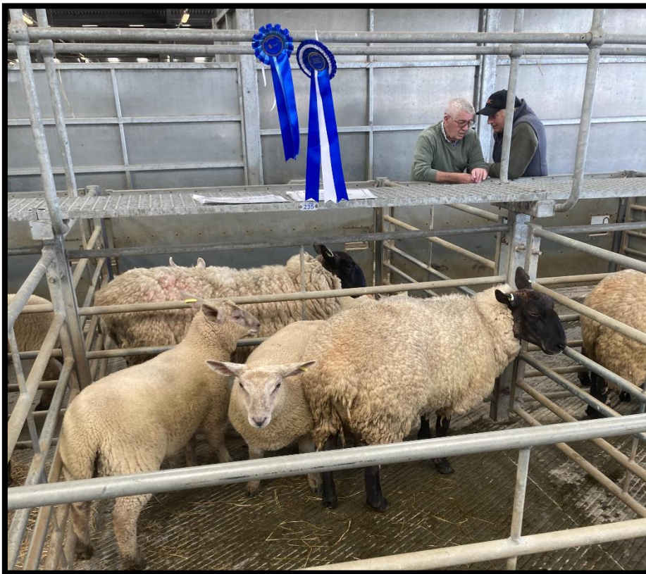
Bradworthy YFC Annual Show & Sale of Couples Doubles First Prize Winner